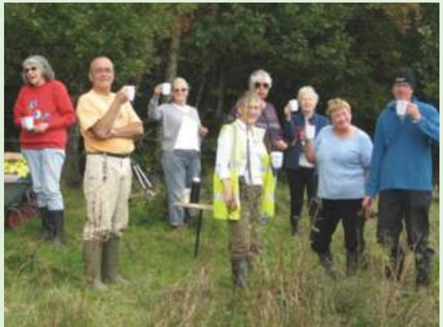
The volunteers taking a coffee break from coppicing.

The work currently being undertaken is the coppicing of hazel and removal of non-indigenous species on the northern border of the North Meadow. This will continue during the winter along with other maintenance and conservation jobs such as removal of encroaching species such as holly and willow.